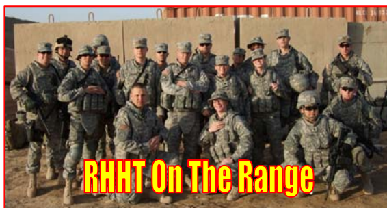
RHHT On The Range