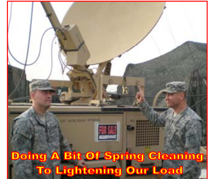
Doing A Bit Of Spring Cleaning To Lightening Our Load

Missions, promotions and leaves have kept us on our toes. Mission is running on all cylinders. Our analysts, reporters, linguists and operators are all